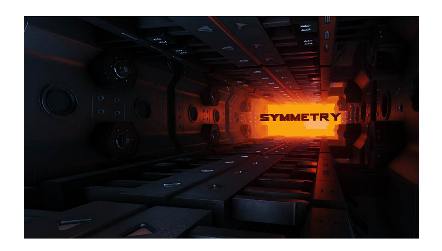
Download Element 3d License File